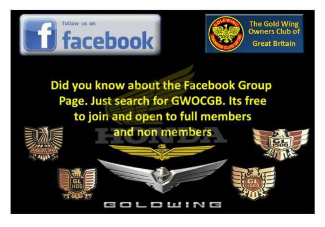
Feb 24 Page 47