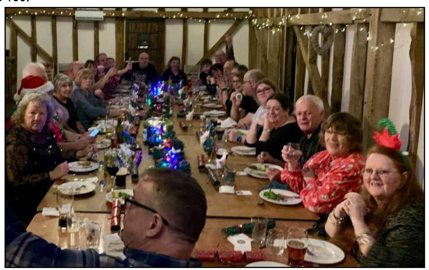
Feb 24 Page 44

Upon arrival, the first drink was on TV&WH - Cheers! It was an amazing venue and best of all was meeting up with some of their Region's new members as well as old ones not staying at the hotel. Then it was time to find our seats and sit down. The Christmas meal was very good and there was even seconds if anyone had the space. Plus, we all got a TV&WH cookie and very tasty it was too.