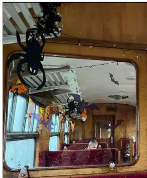
▶ Dressed for Halloween