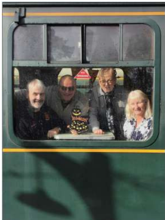
◀ Steam Ride passengers