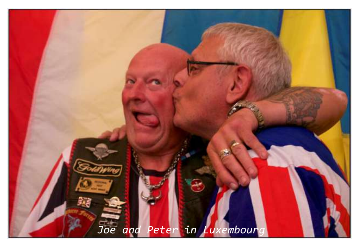
June 23 Page 56