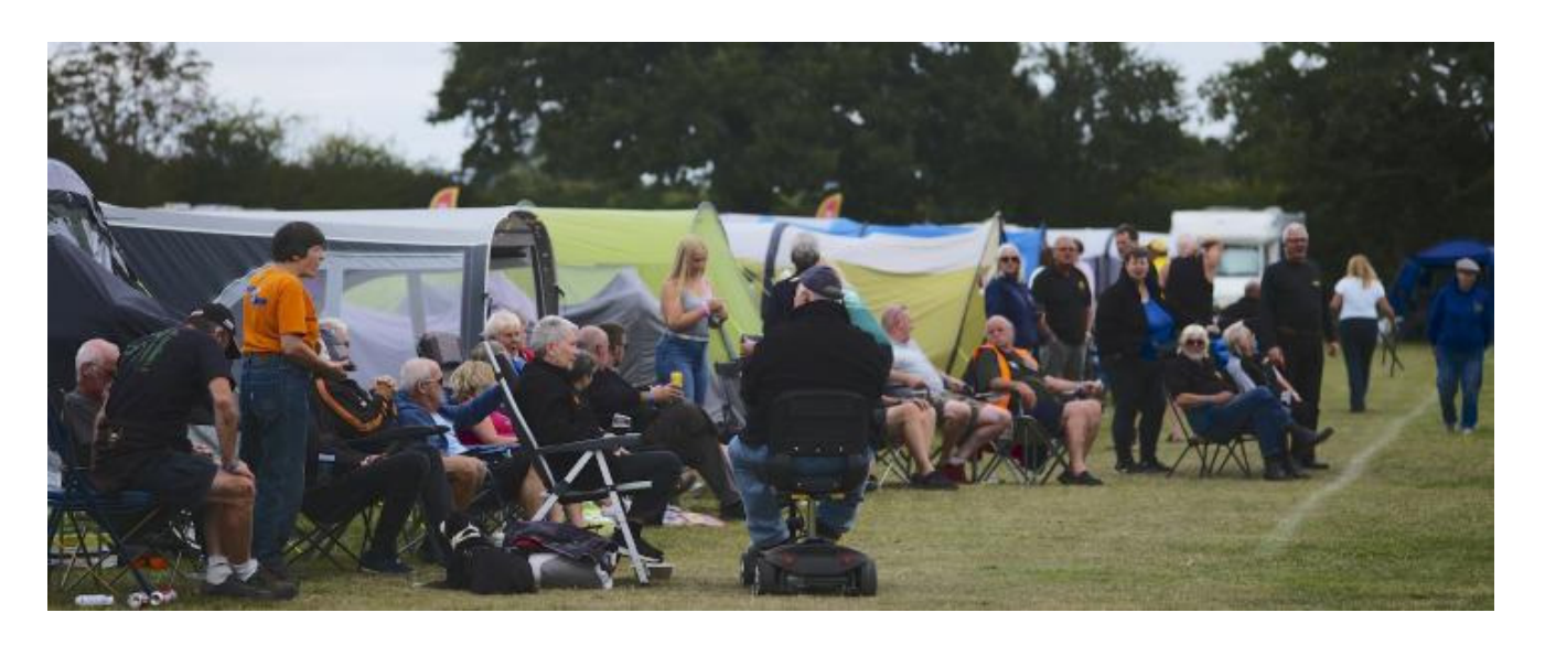
Sunday Afternoon Entertainment 2

A few of us bought some useful goodies at the Top Box sale on Sunday - this continues to be really popular and long may it continue.