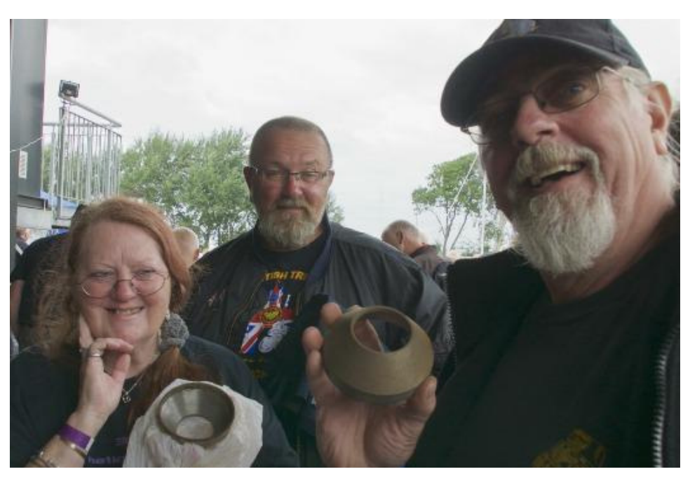
Yetti's Top-Box Find

A few of us bought some useful goodies at the Top Box sale on Sunday - this continues to be really popular and long may it continue.