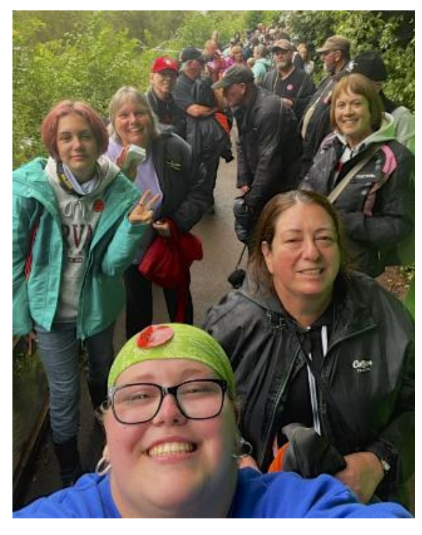
Head of the Wookey Queue

The campsite itself was spacious and quiet and great to get back to after days out exploring the surrounding areas. Evenings were spent around the fire pit reminiscing, having a drink and having a laugh. Day trips included a very interesting visit to the Sammy Miller Motorcycle museum, Swanage and a visit to Wookey Hole Caves and Cheddar Gorge, returning to the campsite via the New Forest. The wild horses were true to form through the New Forest.