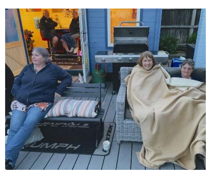
Ladies take a Well Earned Rest