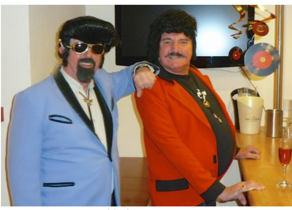
Teddy Boys in Swanage