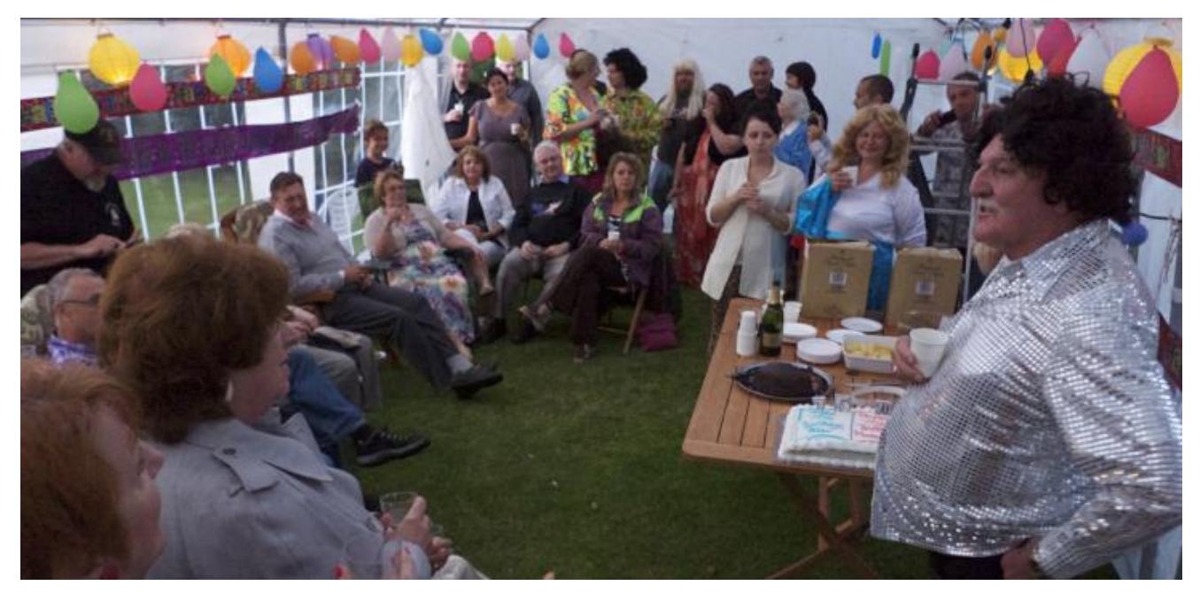
75th Birthday Speech