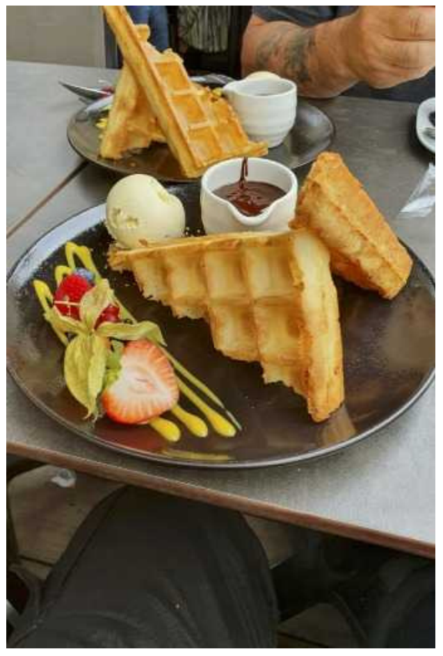
Waffling about in Switzerland

The technical details behind Yetti's outfit is that it's a stripped-down 1985 Aspencade. He has owned it probably 20 years now. The bike has had several different makeovers and this is the latest with a sidecar, Valkyrie tank, car tyre on the back and even a braked sidecar wheel. It's Yetti's winter/fun hack and as he doesn't own a car, the vehicle comes in handy for transporting large items.