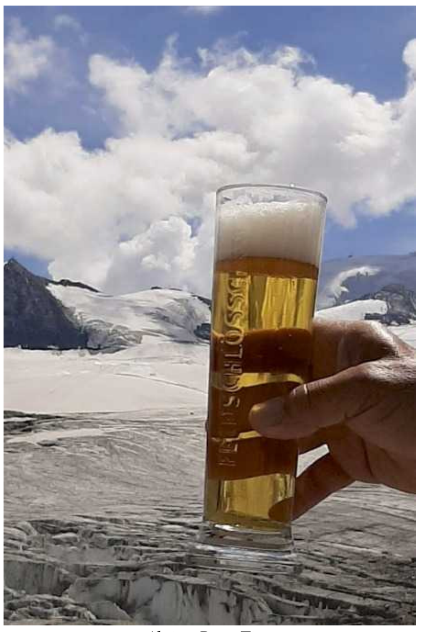
Alpine Beer Time

Finally, one from Taz who suggests that now is the perfect time to become a ventriloquist what with all the face coverings we have to wear.