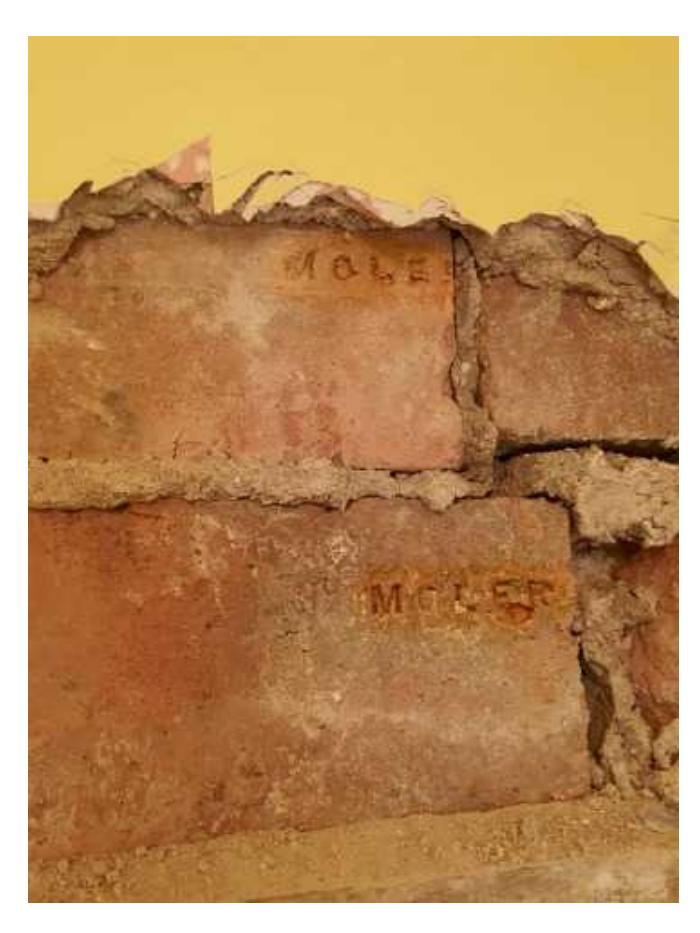
Just Another Day at Work