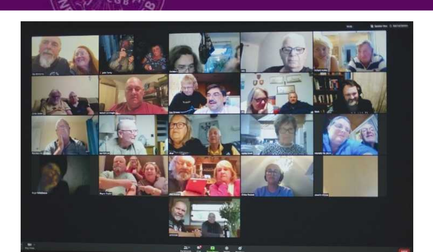
Zoom Mole Night

So, what has everyone been doing during the lockdown apart from walking, reading, baking cakes, sunbathing (a different sort of baking), gardening, decorating and Zoom exercise classes? Well, schooling has been very important as has making masks for Tavistock care workers. Even sorting out the septic tank has excited someone. There has also been lots of bike renovations and re-builds and a few run outs to close neighbours and 'drive pasts' with family and more recently, ride outs with friends to Maldon and Mersea Island. We're waiting for the tea hut at High Beech in Epping to open now.