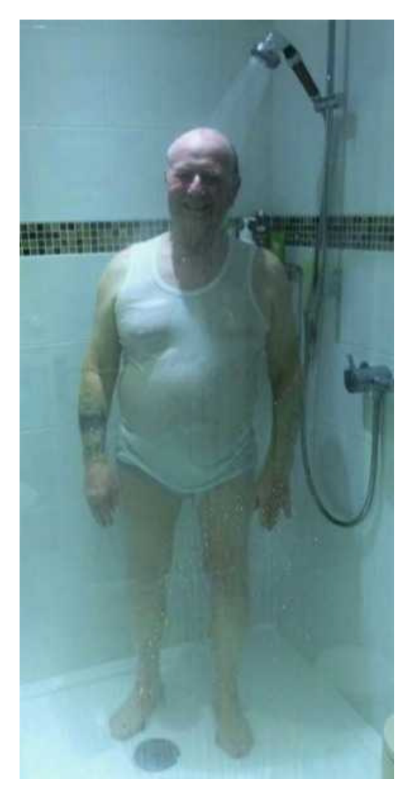
Wet T-Shirt and Y-Front