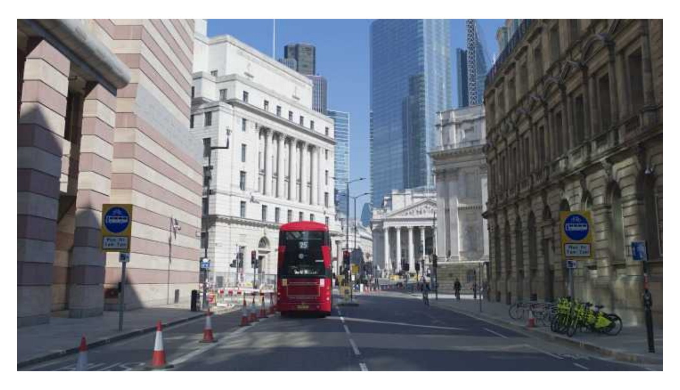
Royal Exchange, Queen Victoria Street