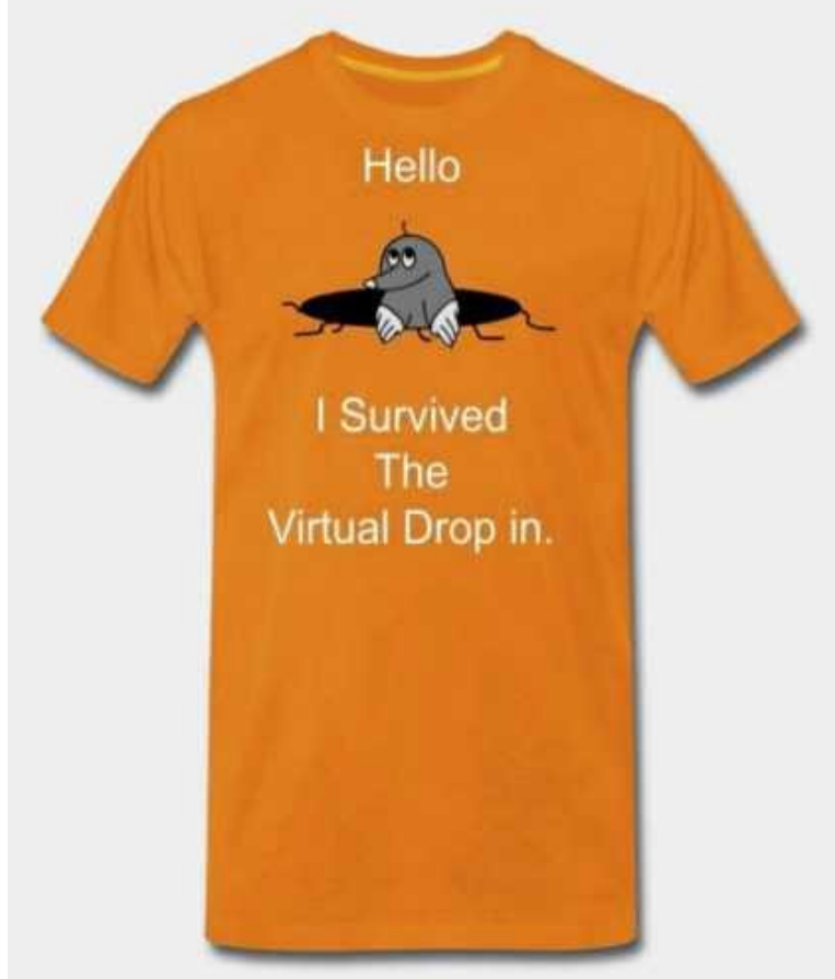
T-Shirt by Big Les