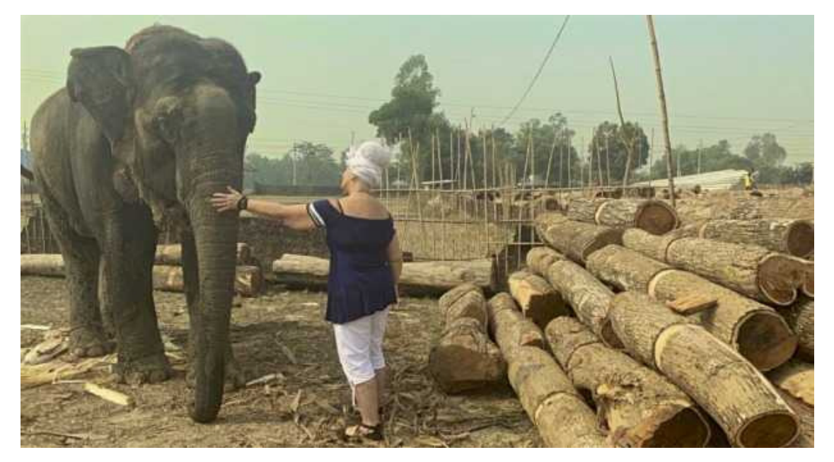
Trudy Talks to the Elephant