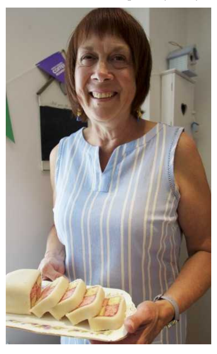
Capital's Master Baker

A selection of finger sandwiches and cakes were piled high with lots of seconds available in cake tins under the table. Apricot and Apple Fruit Cakes, Bakewell Tart, Viennese Whirl, Millionaire's Shortbread, Lemon Drizzle, Fairy Cakes, Madeira Cake, Chocolate Brownies, Bread Pudding, scones with jam and cream and Battenberg cake. They all tickled somebody's fancy during the afternoon. We were even given goody bags to take more home with us. An extra special yum, yum.