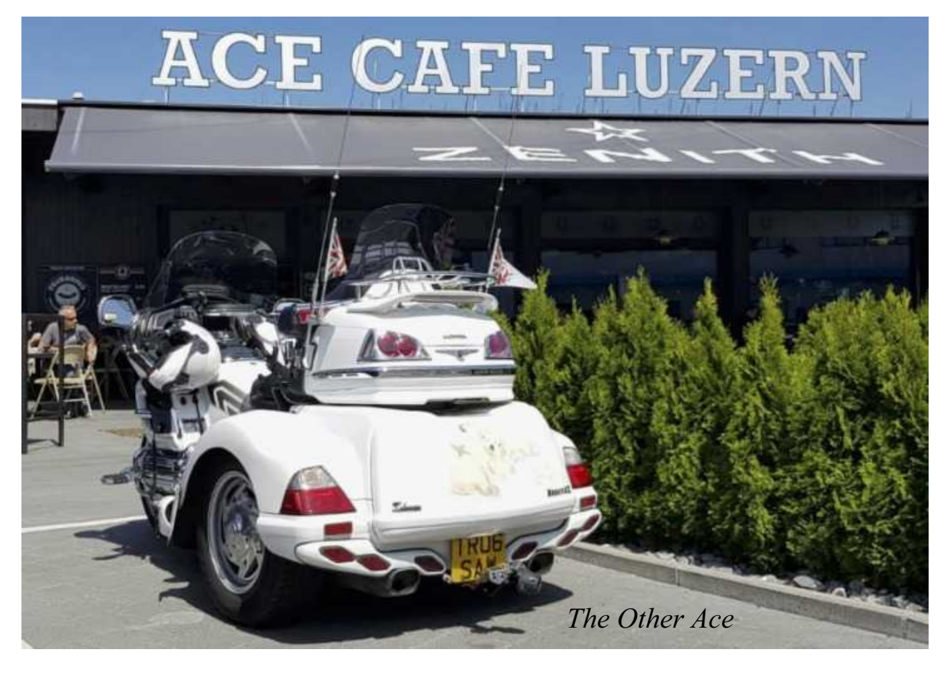
GWOCGB WingSpan November 2019 Page 33