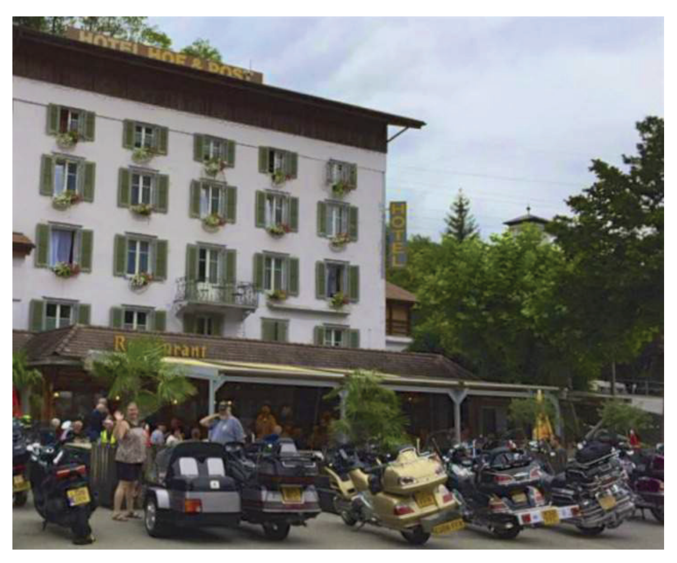
Bikes ready for the off

Innertkirchen is in the Bernese Oberland and lies at the foot of the Grimsel and Susten Passes. There were several groups that went out in different directions each day around the Passes.