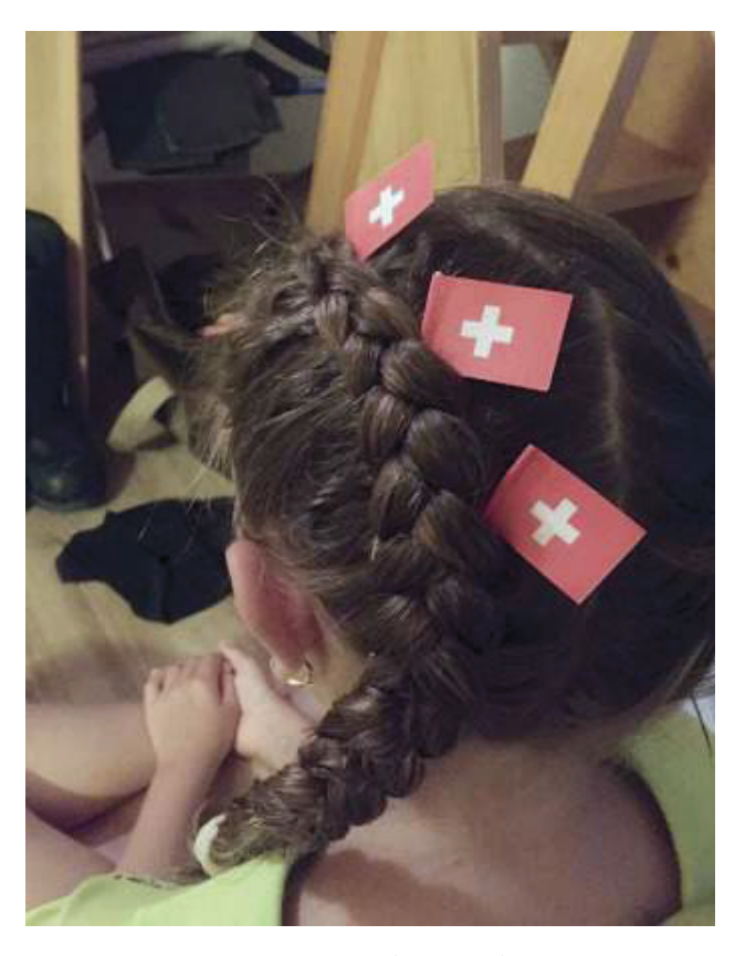
Swiss Night at the Hof und Post

The town put on a spectacular firework display in the evening which the rain didn't dampen.